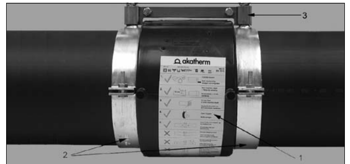
Illustration 10.67 Horizontal anchor point 200, 250 and 315 mm

From diameter 200 mm and above the anchor point consists of one electrofusion coupler (Art. Nr. 41xx95) (1) and two rail brackets (Art. Nr. 72xx10) (2) which are connected using a halter (Art. Nr. 730020) (3) for extra stability (see also illustration 10.67).