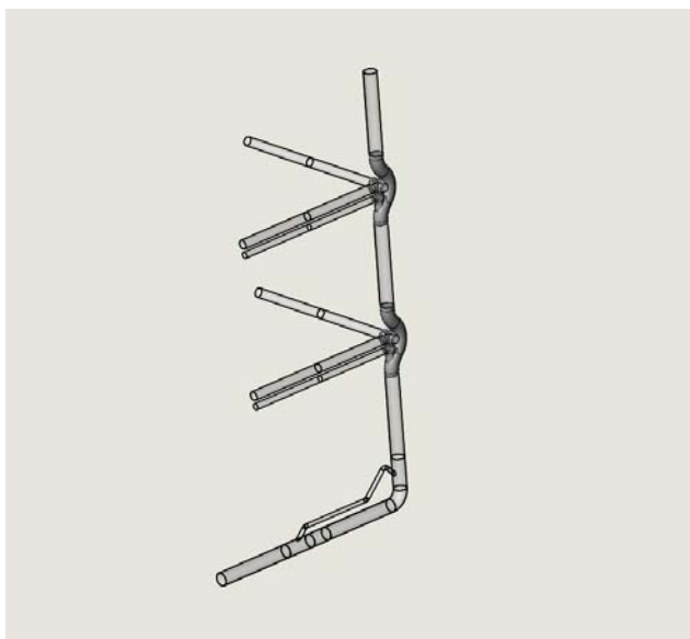
Illustration 1. Schematic of an Akavent stack system

If a single drainage pipe would be used that is just capable of draining the maximum amount of waste water, large pressure peaks would result, sucking dry or blowing out all water traps, giving access for bad odors to enter the living spaces.